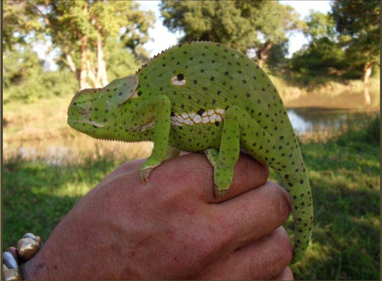
Sighting of the month: A chameleon on the road, by G