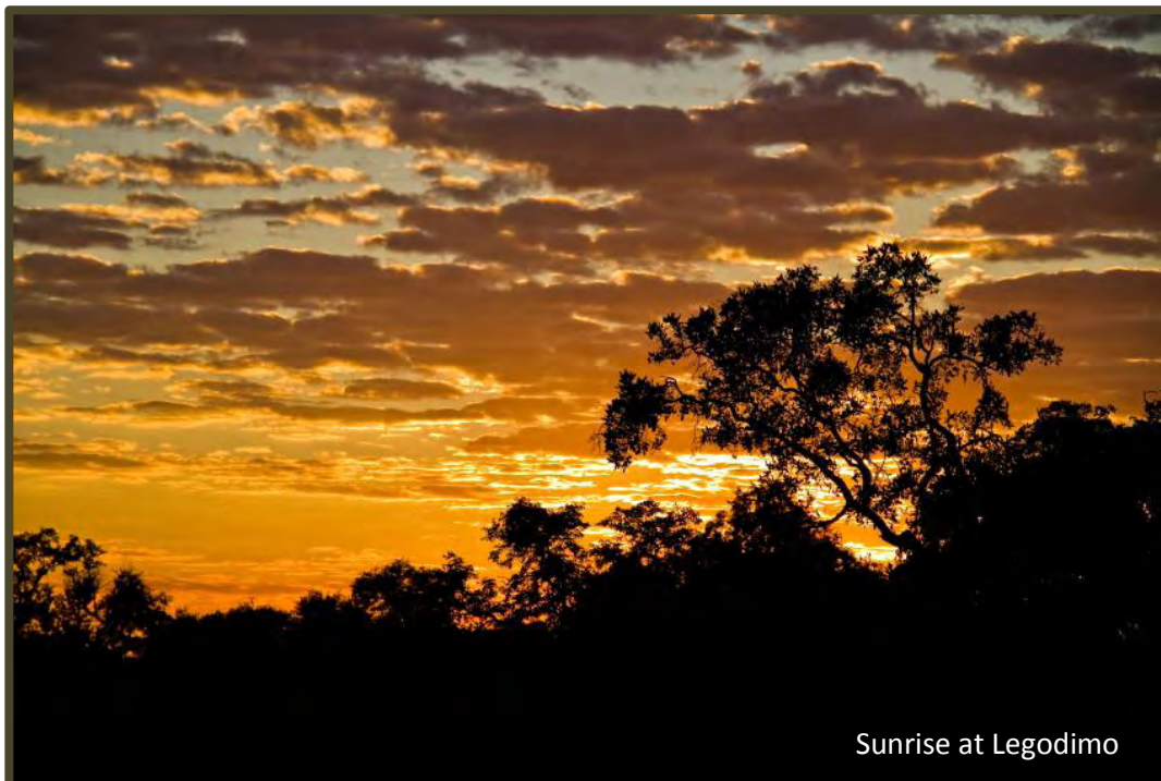
Sunrise at Legodimo